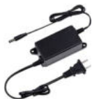
DC12V/2A Power Adapter